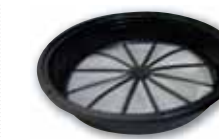
Stainless Steel Meshed Strainer