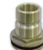
Brass Outlet of 1 1/4" Standard