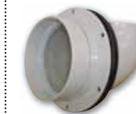
Stainless Steel Meshed Overflow