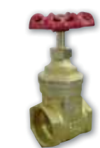
Brass Gate Valve of 1 1/4" Standard